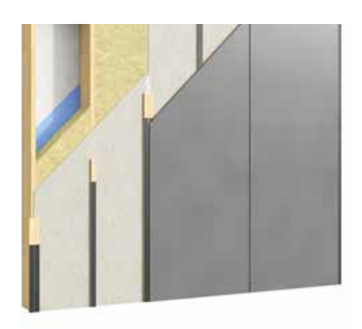
Installation on Alu/steel